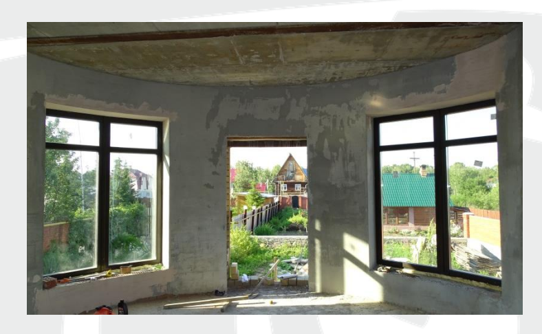
Internal and external finishing of a private house