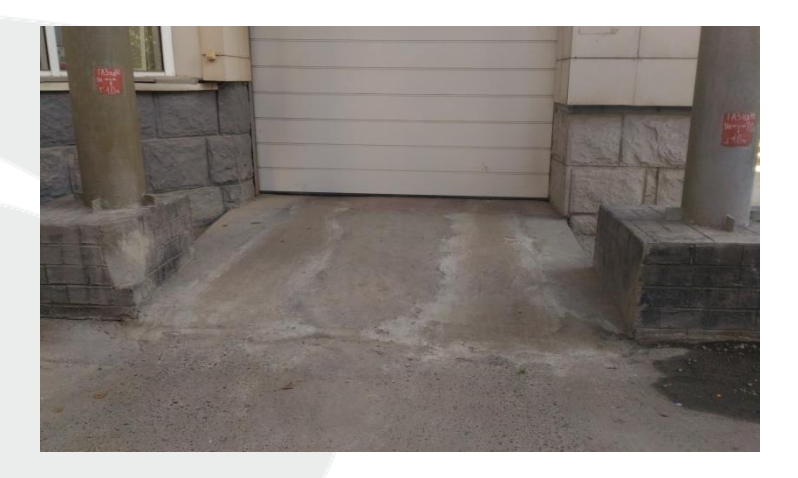
Restoration of the entrance to the parking lot