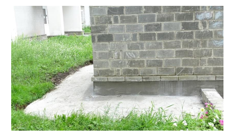
Reconstruction of concrete pavement of ventilation shafts