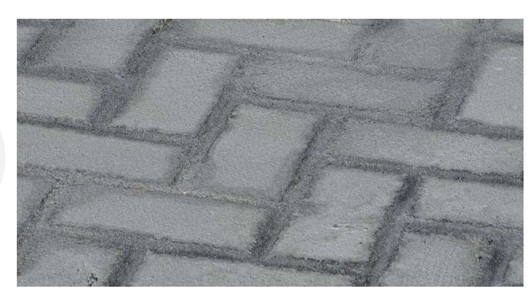
treated with ARENA PolyElast PE in 1 coat