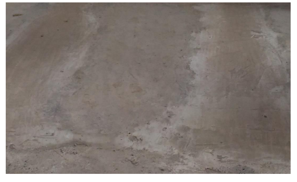
reconstructed surface with ARENA Repair Master R300